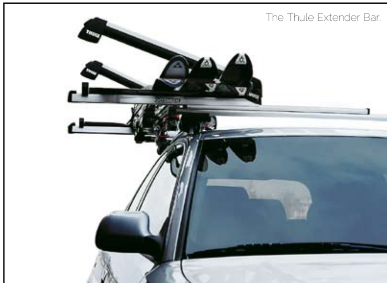
The Thule Extender Bar.

However, the new Yakima ski racks that have just arrived in New Zealand offered a more funky design option with the