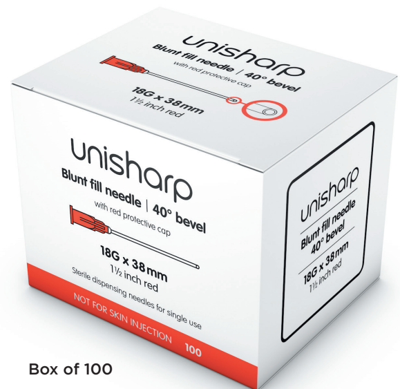
Box of 100