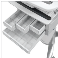
SEVERAL DRAWER CONFIGURATIONS