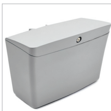
SV STORAGE BIN