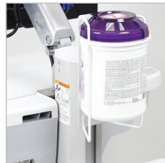
SV SANI-WIPES HOLDER