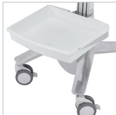
SV FRONT TRAY