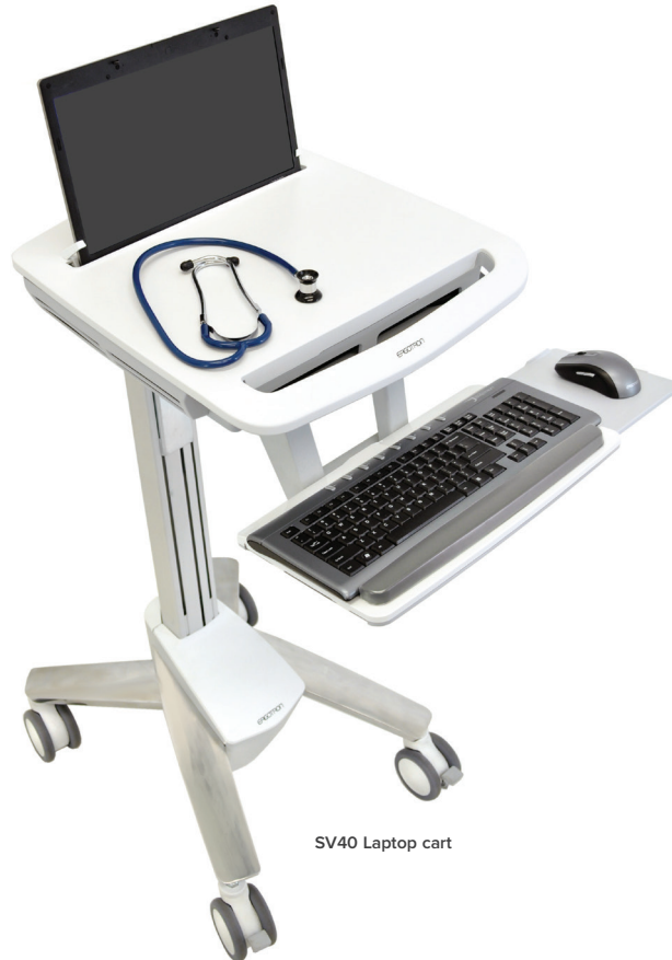
SV40 Laptop cart