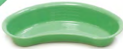
300 mm Kidney Dish