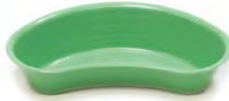
255 mm Kidney Dish