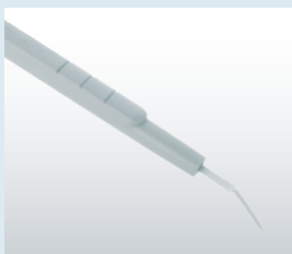
FOOT CONTROL PENCIL

Employed use of sheaths promotes pencil longevity, speeds changeover from patient to patient, and prevents pencil exposure to contaminants.