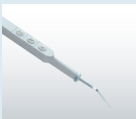
HAND CONTROL PENCIL