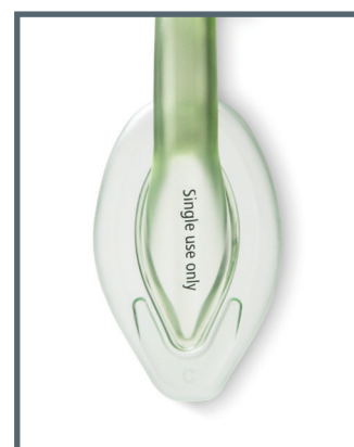
AuraOnce cuff including reinforced tip