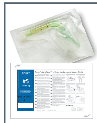
AuraOnce in pouch (IFU/colour code)