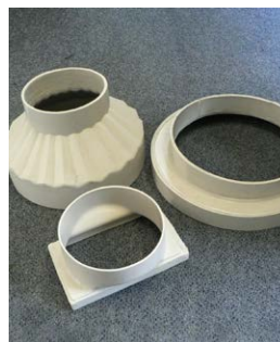
Auger Adaptor Boot