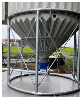
Cert Galv Frame