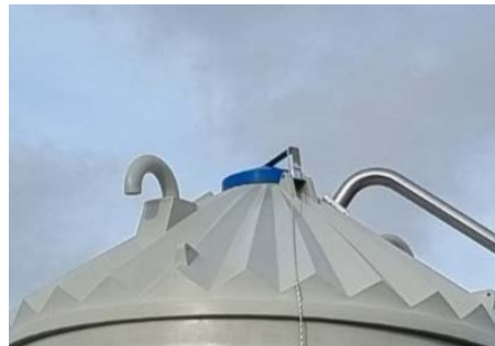
Air Vents & Self-Closing Top Lid