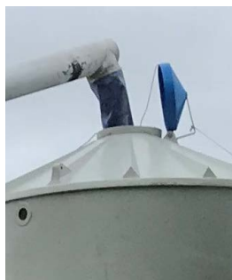
Self-Closing Top Lid