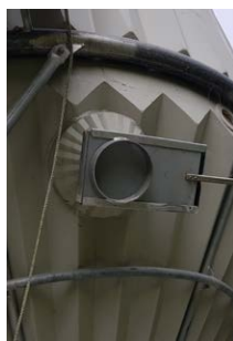
Bag Off Shute

Customised Framing – Requirements outside our standard specifications can be designed and manufactured in house to the dimensions you require (within reason) to accommodate different machinery or systems.