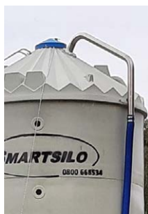
Blower Hose System