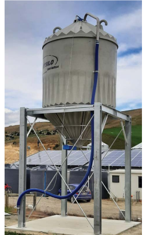
Blower Hose System