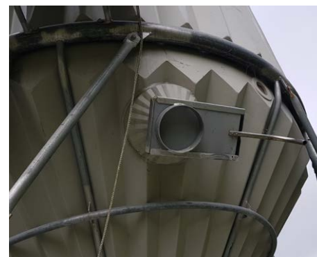
Bag Off Shute