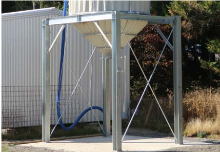
Certified Hot Dipped Galvanised Framing