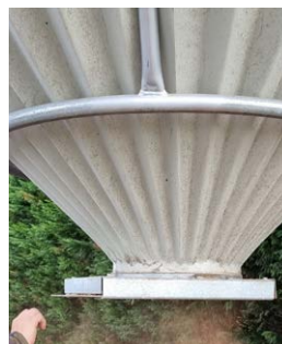
Slide Shutter System