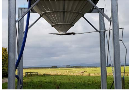
Side Handle Slide Shutter System