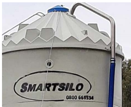
Blower Hose System